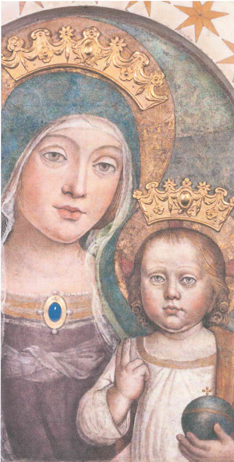
The ancient fresco of Madonna del Soccorso (Our Lady of Help) in St. Peter's Basilica was restored with the support of the Knights of Columbus to mark the Year of Faith (2012-2013).

O Mary, you always brighten our path as a sign of salvation and of hope. We entrust ourselves to you, Health of the Sick, who, at the Cross, took part in Jesus' pain while remaining steadfast in faith.