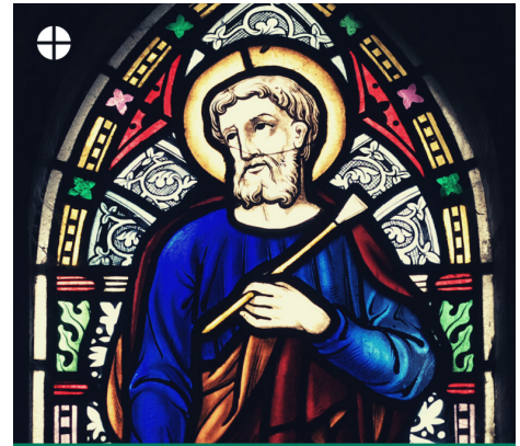
ST. LUKE THE EVANGELIST

Dearest St. Joseph, at the word of an angel, you lovingly took Mary into your home. As God's humble servant, you guided the Holy Family on the road to Bethlehem, welcomed Jesus as your own son in the shelter of a manger, and fled far from your homeland for the safety of both Mother and Child. We praise God that as their faithful protector, you never hesitated to sacrifice for those entrusted to you. May your example inspire us also to welcome, cherish, and safeguard God's most precious gift of life. Help us to faithfully commit ourselves to the service and defense of human life —especially where it is vulnerable or threatened. Obtain for us the grace to do the will of God in all things. Amen.