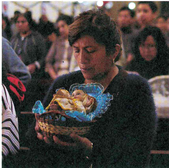
A woman holds a figurine of the Christ Child during Mass on the feast of the Epiphany.

Epiphany, on the other hand, is made for celebration, gift-giving, going all out. Perhaps someday we can return to the traditions of Epiphany and restore Christmas as a day of rejoicing and worship.