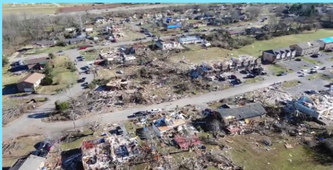
TORNADO DAMAGE FROM THE SKY IN BOWLING GREEN, KENTUCKY (NWS) WWW.WPDE.COM

Items most in need of: coats, AA batteries, and D batteries.